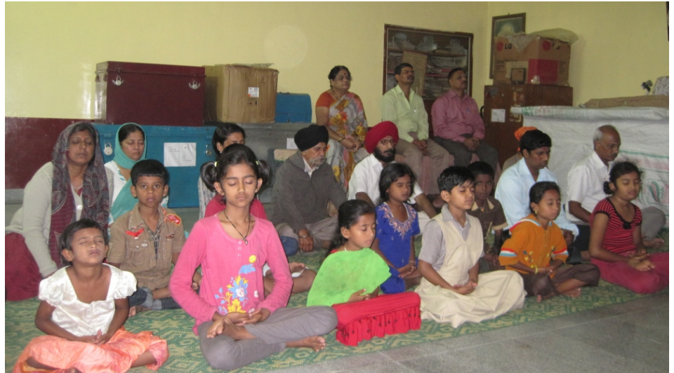
A Channelling session at Gurudwara Sahib, Sanjaynagar, Bangalore