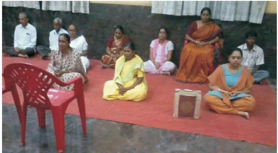
A Channelling session at the Regular Light Channelling Center in Vijayanagara, Bangalore