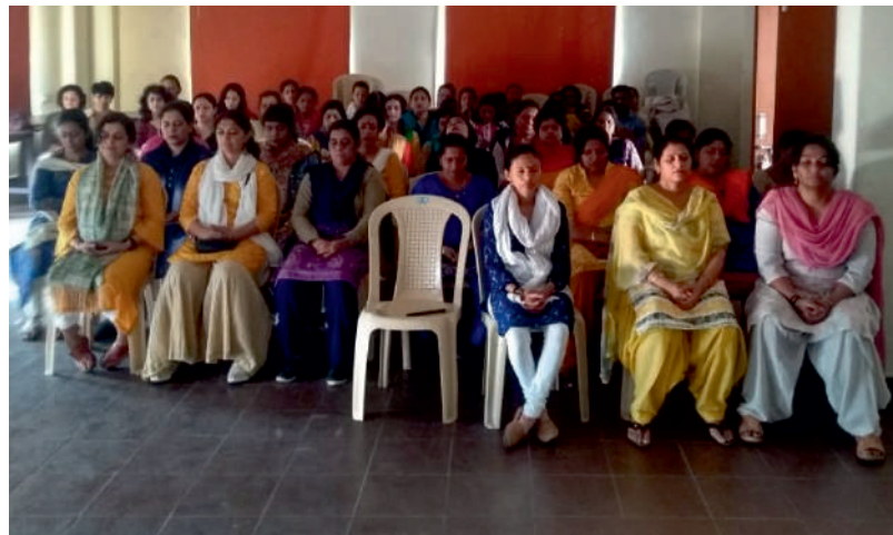
Teachers of Army Public School, Bangalore, channelling Light on February 15, 2018

Millions have benefitted by practising Light Channelling regularly. Many have received miraculous help and have had wonderful experiences. Your experiences may inspire others and may guide others. Please share your experiences with us. Please write to us at: info@lightagemasters.com